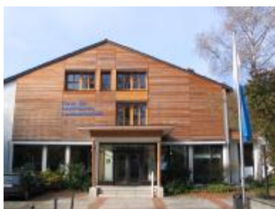
© Haus der Bayerischen Landwirtschaft Herrsching